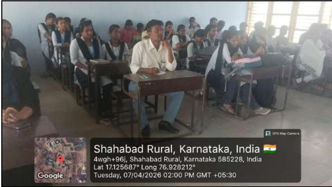
Students and staff members actively participated in the program.